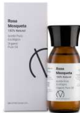
Rose hip oil 60 ml