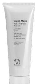
Green Mask Green clay 300 gr