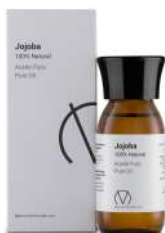
Jojoba oil 60 ml