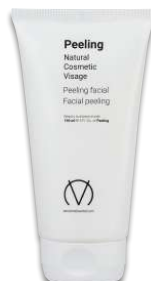
Peeling Face 150 ml