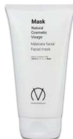
Mask Face 150 ml