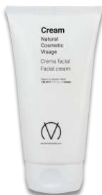
Cream Face 150 ml