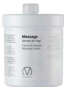
Massage Wheat germ massage cream 1000 ml

You can add essential oils in all these cosmetics.