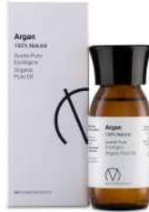
Argan oil 60 ml